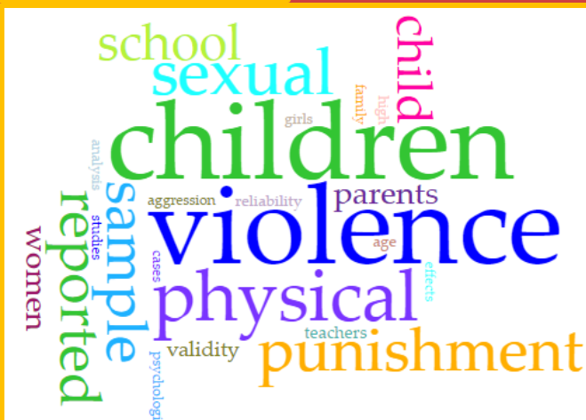
Violence Against Children and Youth