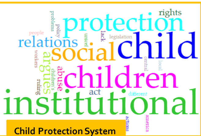
Child Protection System