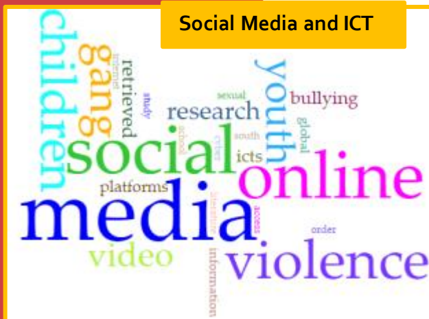
Social Media and ICT